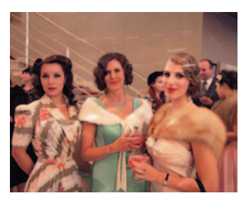
Vintage by the Sea festival

There's big festival energy right on your doorstep. Make the most of your weekends with the region's largest open air music festival, Highest Point, or try something different at the kitsch filled Vintage by the Sea in nearby Morecambe.