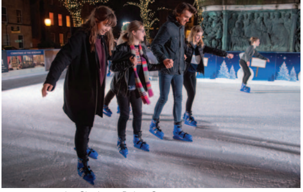
Ice Skating at Dalton Square