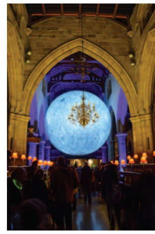
Installations at Light up Lancaster