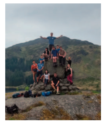
Lancaster University Hiking Club