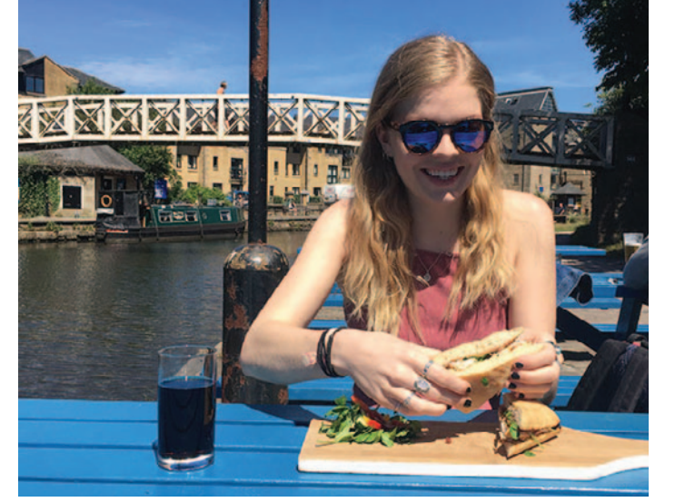
The Waterwitch pub