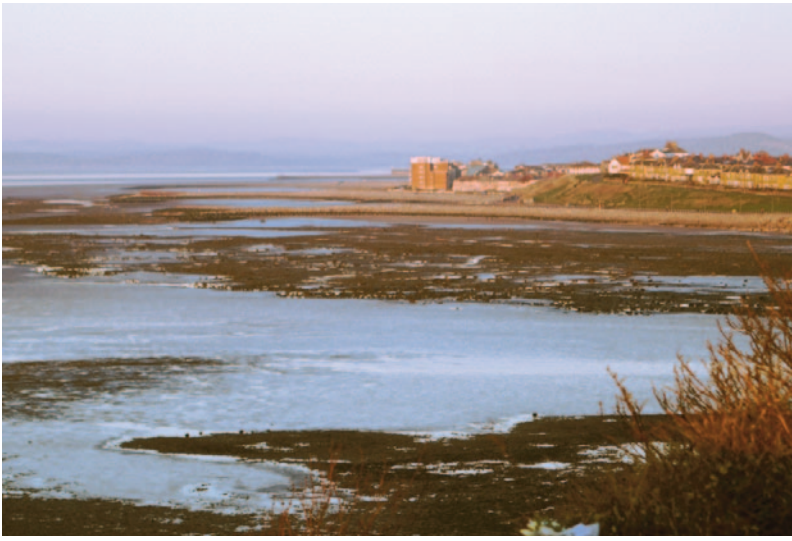
The coastline at Heysham