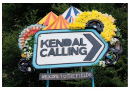
Kendal Calling Festival