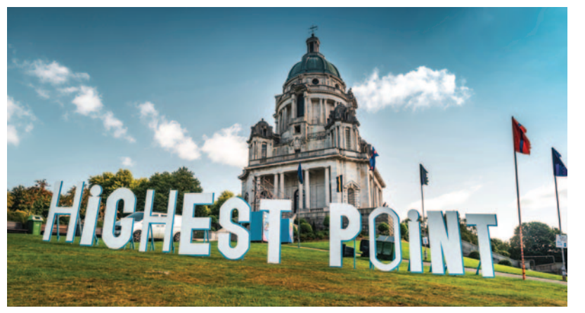
Highest Point Festival at Williamson Park

For more information, please visit lancaster.ac.uk