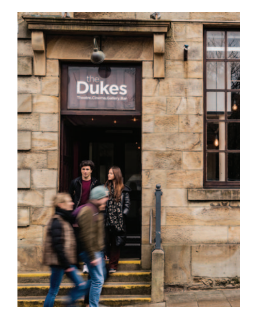
The Dukes Theatre