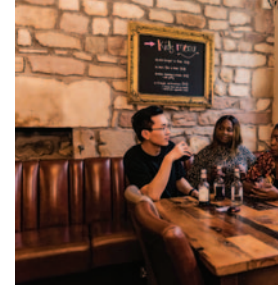
The Sun Inn