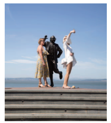
The Eric Morecambe statue, Morecambe Bay