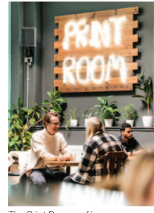
The Print Room café

Lancaster's coffee quarter has a long history; our primary roaster opened its doors in 1837. Alongside are a host of cafés depending on your mood. Relax in the vegan oasis of Herbarium, keep it cosy in Brew or hit some familiar favourites like Starbucks or Café Nero. Many cafés open late into the evening and offer space for music, comedy, gaming and more.