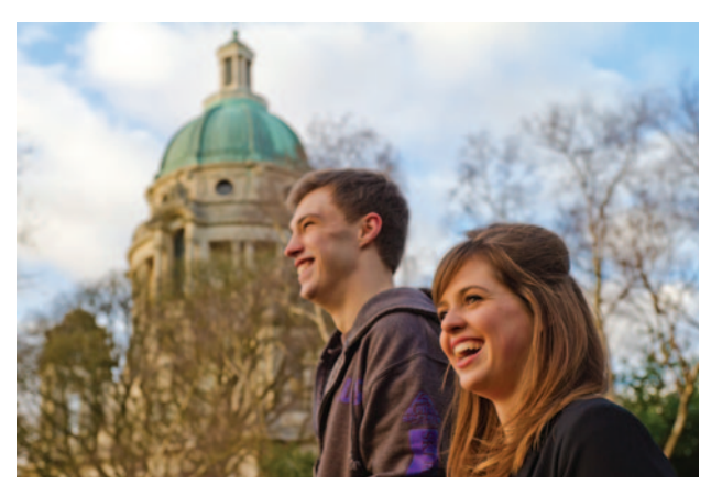
Ashton Memorial, Williamson Park

The City of Lancaster is a wonderful neighbour to campus. Its fascinating heritage and stunning architecture give student life an impressive setting. Whilst Lancaster Castle and the Ashton Memorial dominate the city's skyline, traditional cobbled streets and secret lanes offer old world character to explore.