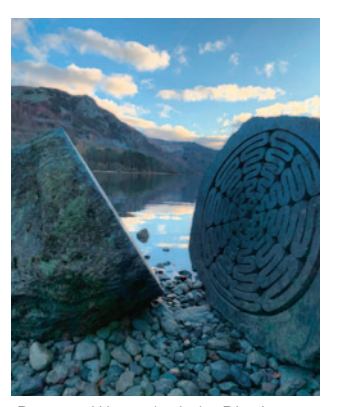
Derwent Water, the Lake District